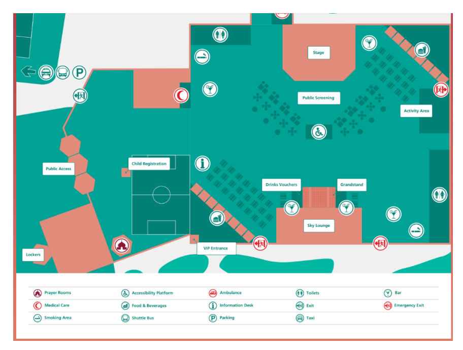
Figure 2. Location Map of the FIFA Club World Cup Qatar 2019 (Club World Cup Qatar 2019 Fan Zone - Presented by Alibaba Cloud, 2019)