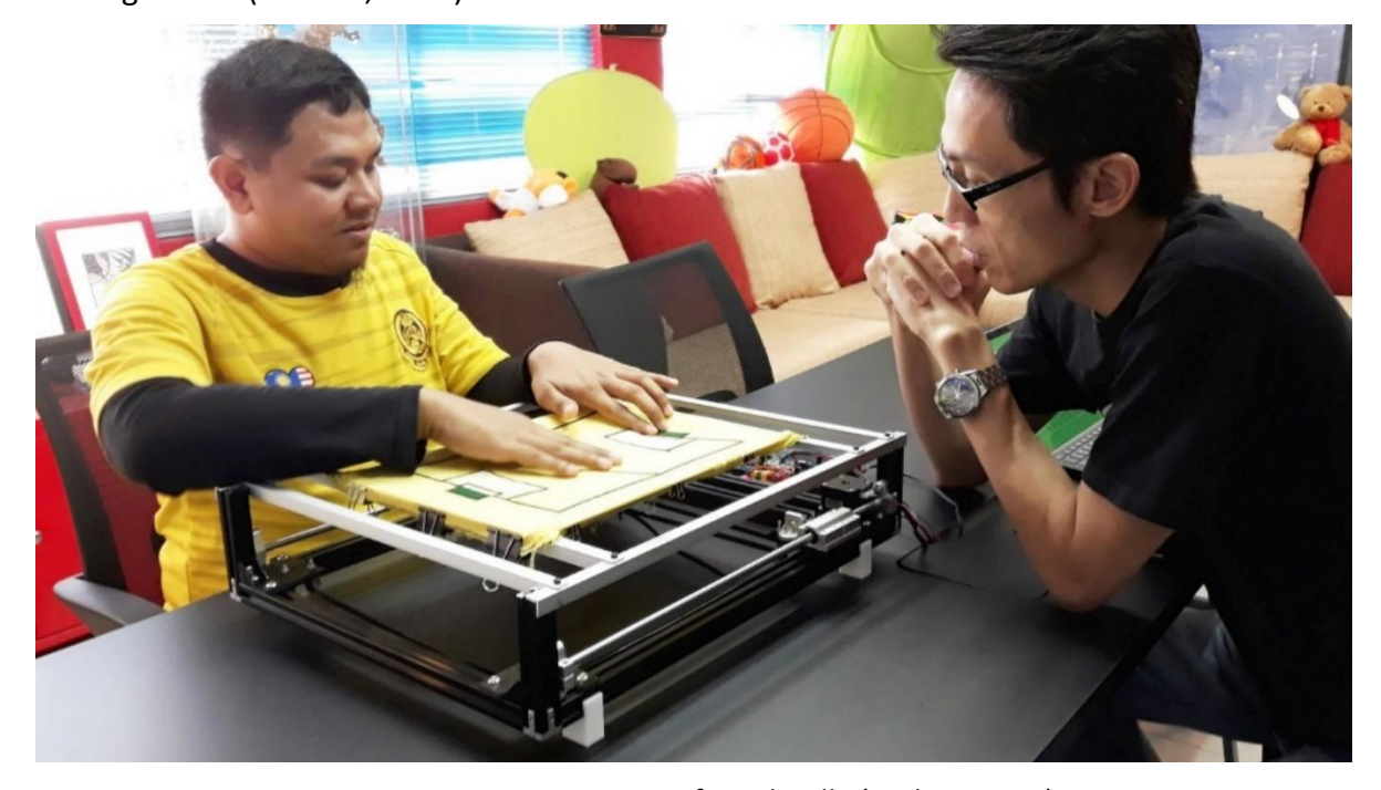
Figure 3. User experience of Footbraille (Brohier, 2019)

Footbraille is a haptic technology that allows users with visual disabilities to track the exact location of the ball through a touch-based table ("Footbraille Digi Merdeka Campaign 2019", 2019). The Footbraille is designed by Digi, Mojo Films, and in collaboration with Naga DDB Tribal Malaysia in 2019. The Footbraille utilizes custom software that automatically detects and syncs the football match to allows users to "feel" the match (Brohier, 2019). The Footbraille works by allowing users to place their hand on carpeted device that mimics the football field pitch. During the game, a miniature ball moves in sync with the game match therefore fans can easily track the game status. As of now the technology is being developed as a prototype and has been launched in sport events in Malaysia. In the upcoming development phase, Footbraille aims to instantly sync the matches with live matches, and training videos (Brohier, 2019).